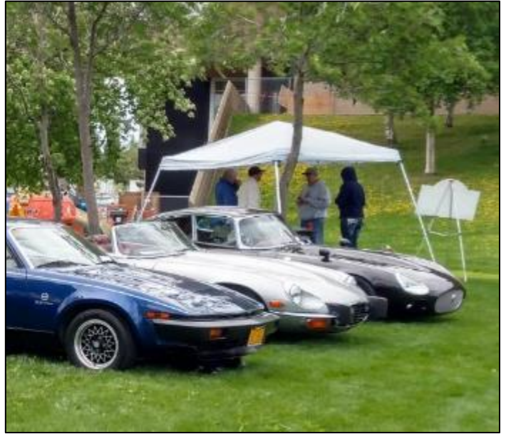
Twenty-six cylinders at the registration tent