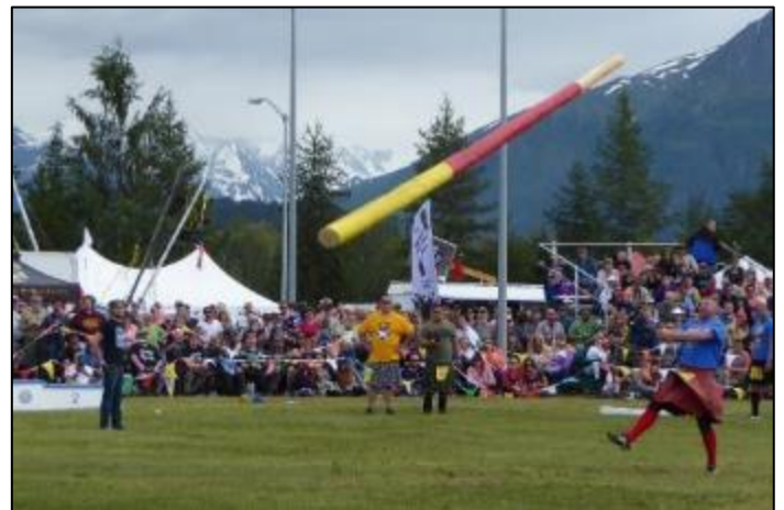
Caber toss: strong men in plaid throwing large heavy objects. 2016