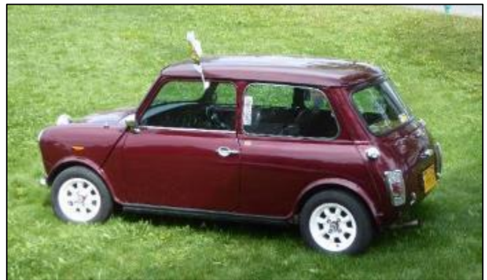
Best of Show: Travis & Jacqueline DeMoss's 1989 Mini 30 -KM-