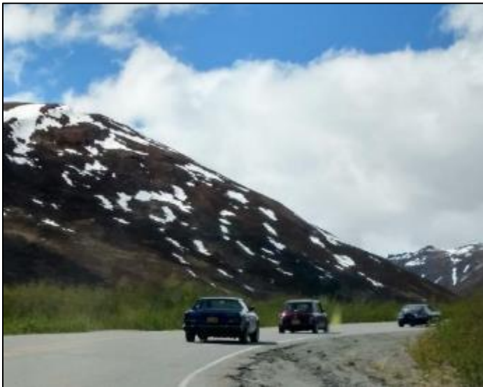
Only four cars, but plenty of fun. A week earlier, the snow was still on the road.