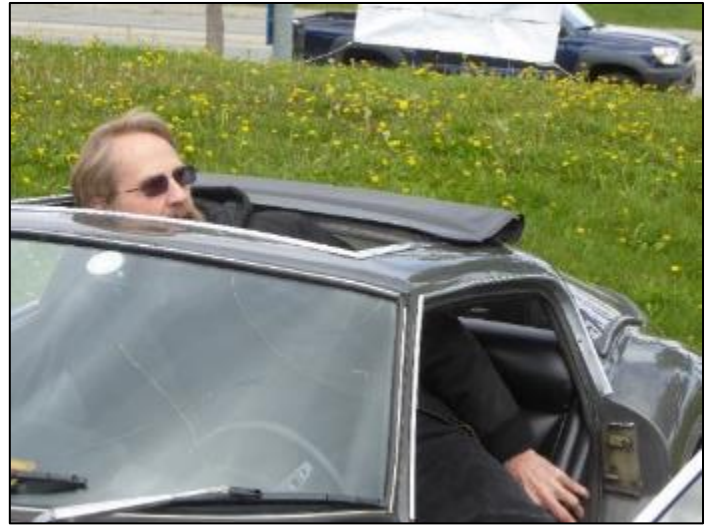
... and makes his usual exit