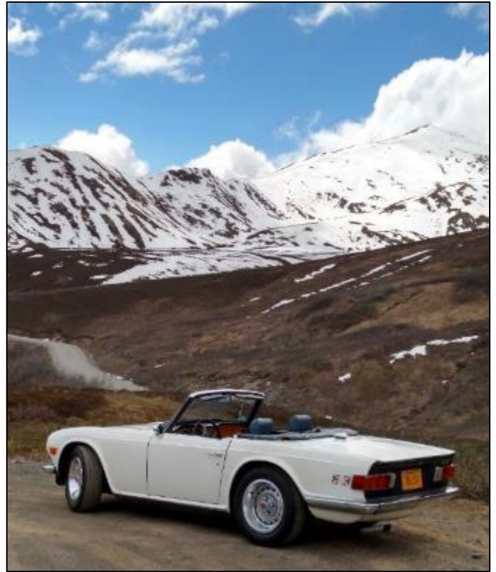
Triumph TR6 at Hatcher Pass Lodge. The road beyond was still closed.