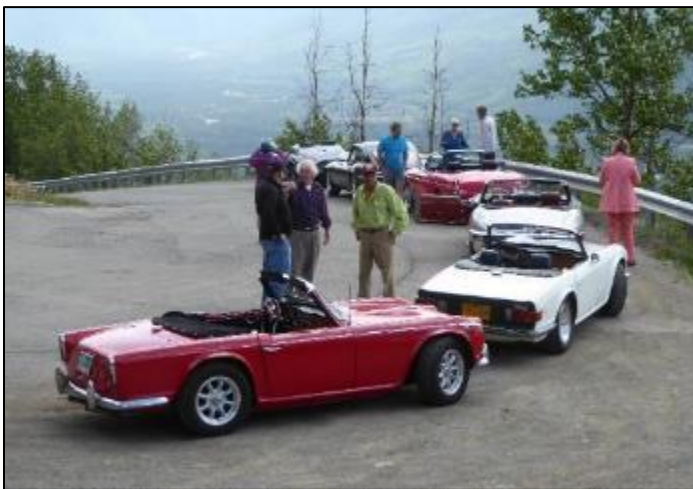
Sitting on top of the world. Barclay Drive via Stewart Drive. TR4, TR6, E-Type, MGB, E-Type, Marcos