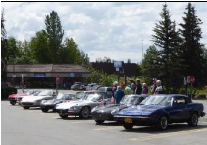
3 Jaguars, 2 Triumphs, 1 Marcos, 1 Mini, 1 MG at Carr's Eagle River start