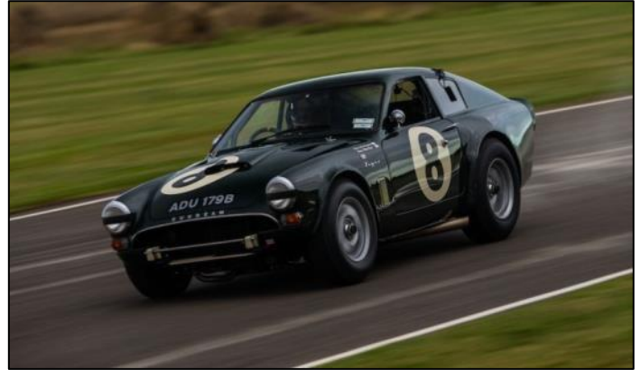
Tiger coupe, above, tintop racing, below

cars.... The (Goodwood) Revival event is a magical step back in time to motor racing as it used to be in Goodwood's heyday."