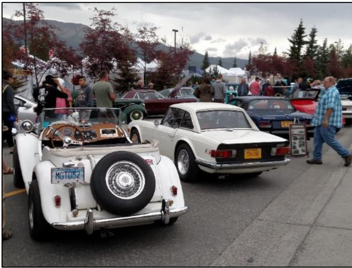
Jay bravely showed up with his MGTD's top folded, but soon put it up.