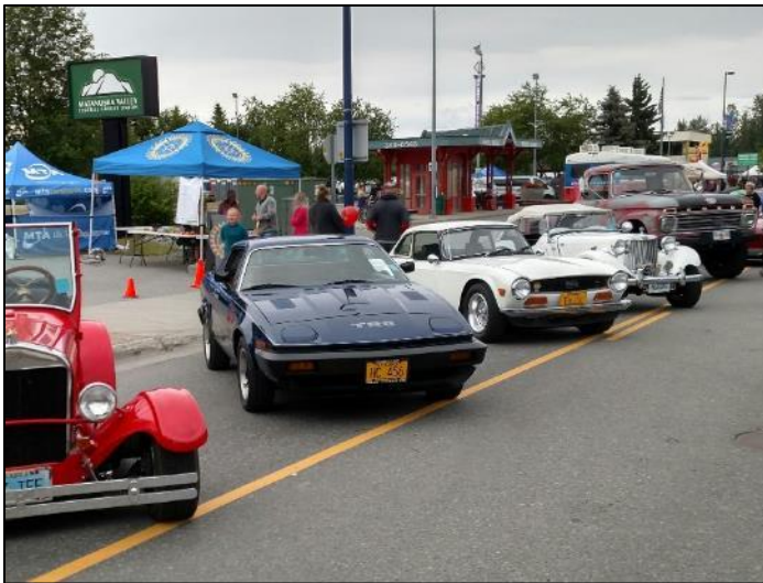
Two Triumphs and an MG, bracketed by old Fords.