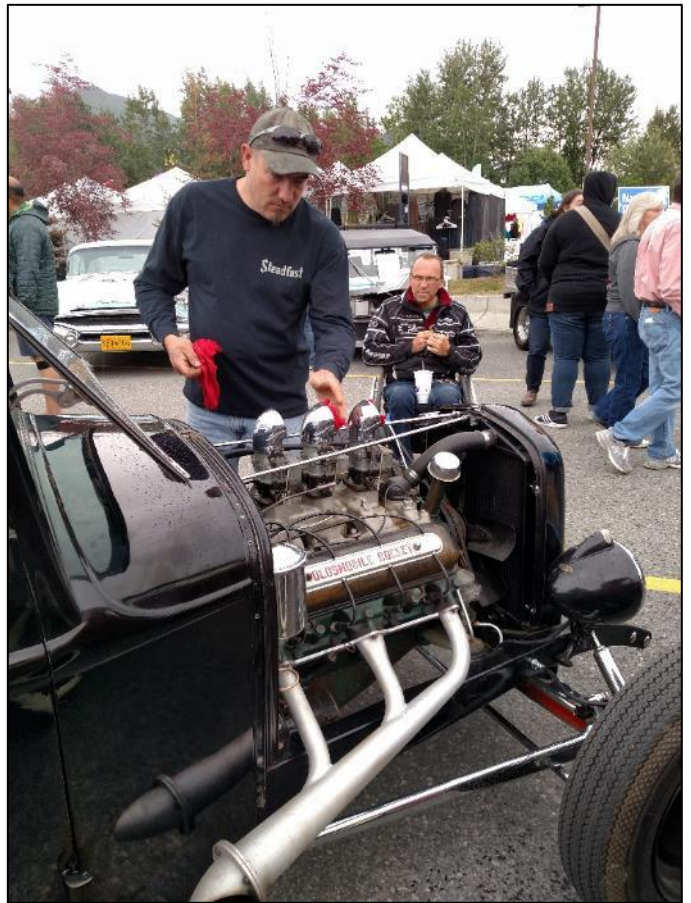
The owner of this Ford hot rod, built in the early '50s, stuffed shop rags in his carbs to keep the rain out.