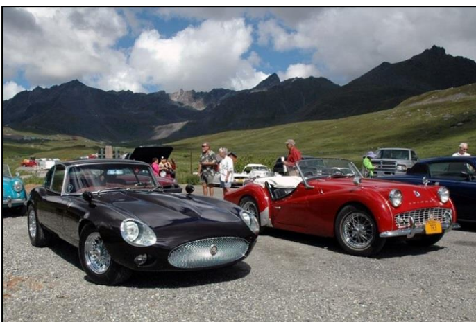
Service at the lodge gave us plenty of time to visit, and the weather was perfect. After a great afternoon, we all headed home.