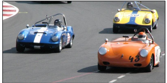
MG-powered Elva Couriers dice with Porsche at PIR