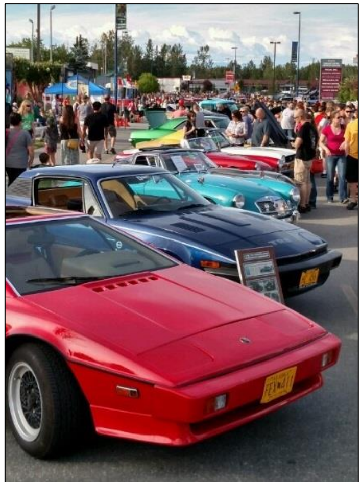
Tom & Jerri Lochner's Lotus, plus Dean's Triumph and Debi's MG

Over 160 classics, customs, street rods, trucks, and sports cars were on display at the Bearpaw Festival Classic Car Show on July 10. We had eight cars in our group, including two new members.