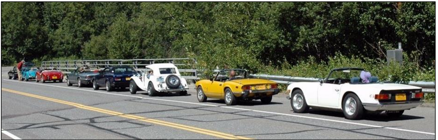
E-Type, MGA, TR3, Jaguar XJS, TR8, MGTD, Spitfire, TR6 line up across the Little Susitna River Bridge.

One MG, one Triumph, and one Suburban departed from the Northway Mall on Sunday, July 19, for Hatcher Pass. Another Triumph joined us in Chugiak, and two Jags were waiting for the group in Palmer. By the time we left Palmer, we had been joined by two more Triumphs and another MG. Still another MG joined us at the Hatcher Pass Lodge.