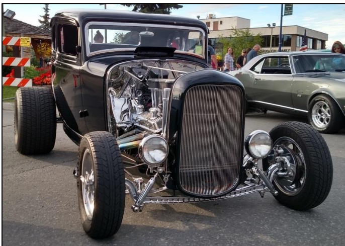
Best Street Rod prize winner