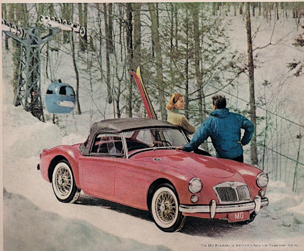
The MG Roadster at Vermont's fabulous Sugarbush Valley.

Going abroad? Have a BMC car meet you on arrival. Write for details.