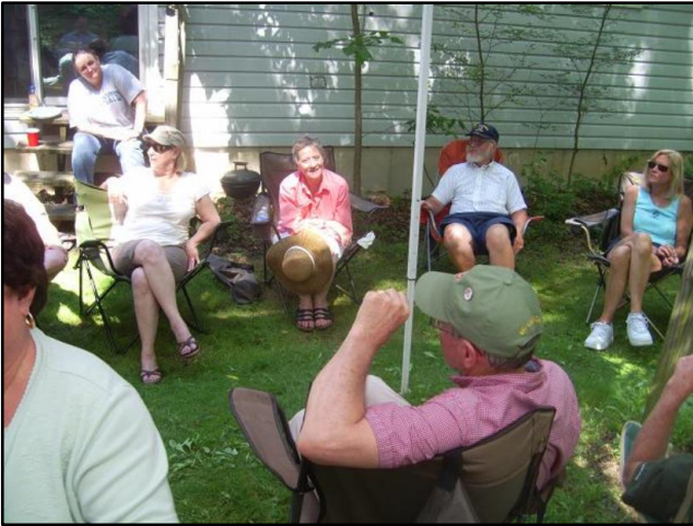
holding the picnic and mentioning up-coming events

The members also presented additional treats to wet the palate, including casseroles, salads and deserts. Also available were various drinks to help wash the goodies down.....! The president presented a short meeting/announcement thanking our hosts for