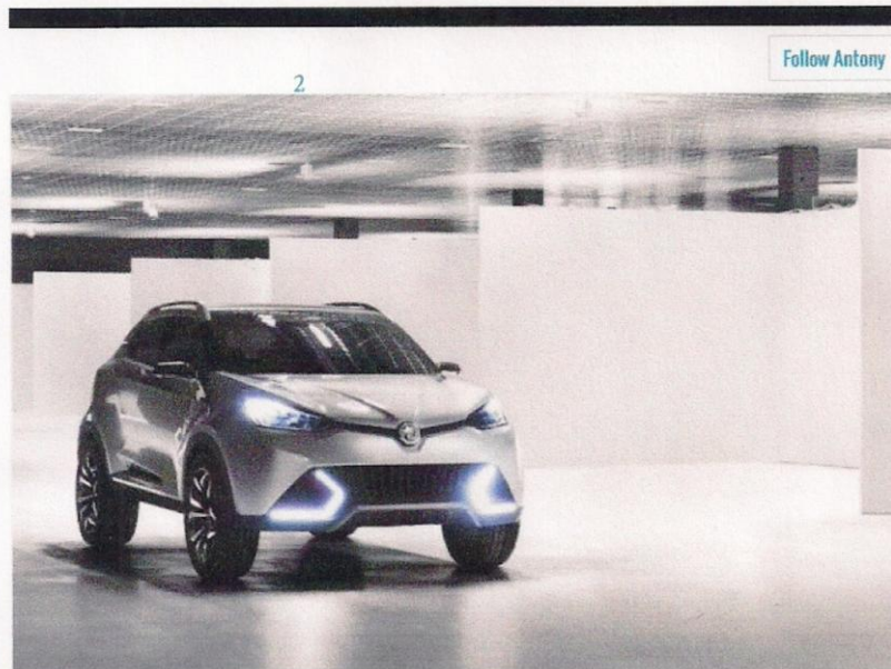
MG CS Crossover Concept, 2013 Shanghai Auto Show

HI-RES GALLERY: MG CS Crossover Concept, 2013 Shanghai Auto Show