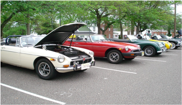
Williamstown Show (above & below)