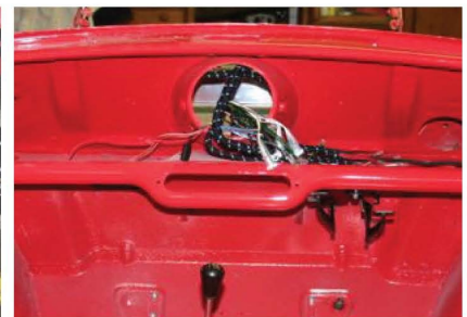
Have a new appreciation for Alec Issigonis and his concept and design of what is now the accepted way to mass produce automobiles worldwide.