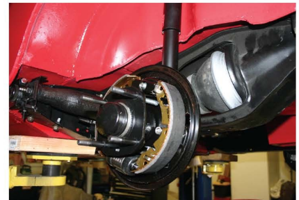
How nice to work with all new parts, we'll have a brand new 1966 soon.