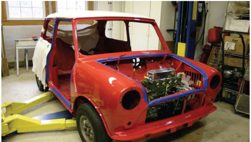
What a great paint job, worthy of any Jag or Aston Martin.

The door bell just rang, new parts on the porch from UPS, gotta go.